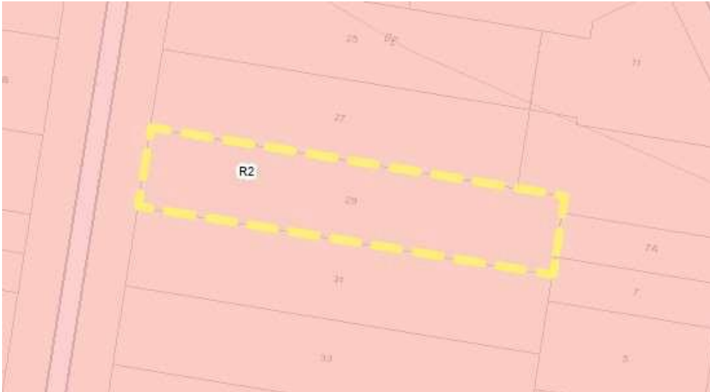
Figure 3: Zoning Map

The development site is zoned R2 Low Density Residential under the provisions of the Canterbury Bankstown Local Environmental Plan 2023 as illustrated by Council’s zoning map extract below.