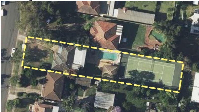
Figure 1: Site Plan